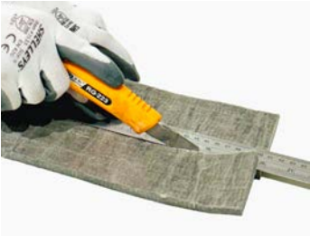
Proprietary dust control